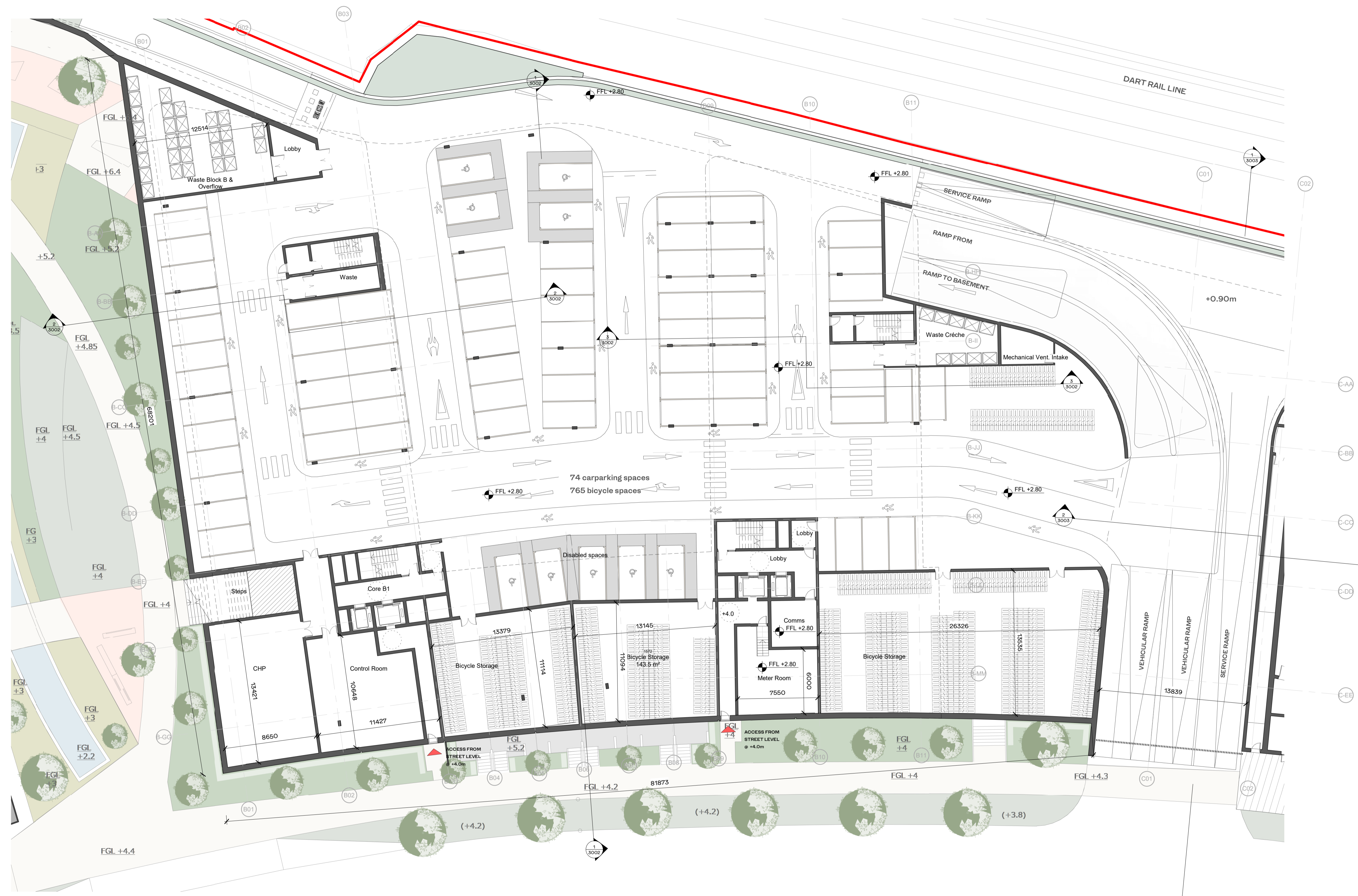
1 ZONE 02 - BLOCK B - LOWER GROUND FLOOR 1:200

Henry J Lyons Architecture + Interiors +353 1 888 3333 info@henryjlyons.com 53-54 Pearse Street Dublin D02 K466